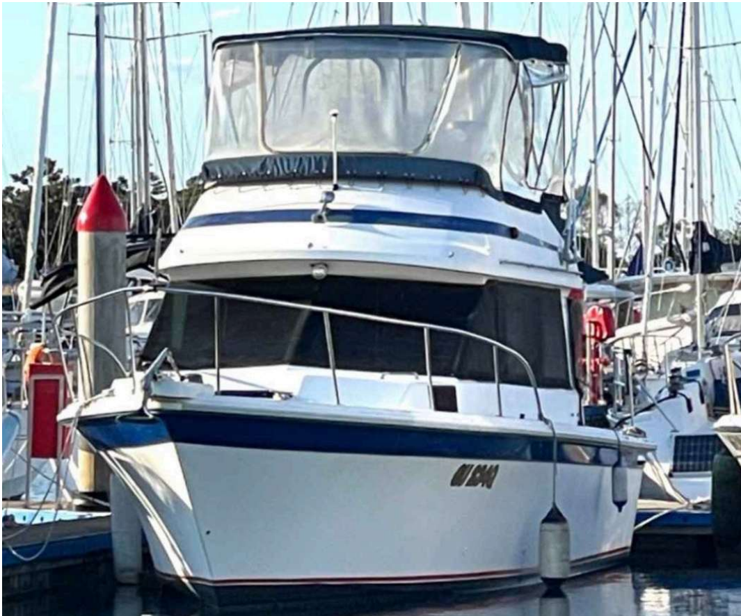
Jay Gee just before antifoul